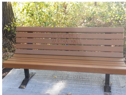
The selected bench is pictured above.

Bench placement will be done by parks staff as time and weather allow. Every effort will be made to complete installation within four weeks of receiving the bench, except in winter months.