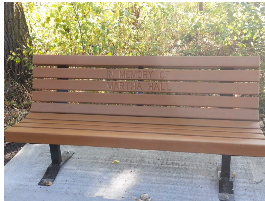
The selected bench is pictured above.

Bench placement will be done by parks staff as time and weather allow. Every effort will be made to complete installation within four weeks of receiving the bench, except in the winter months.