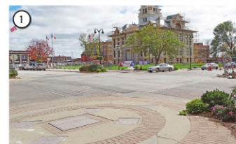
Enhanced corner treatment at Main and Center Street