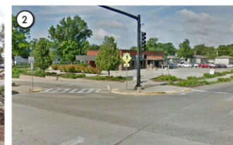
Crosswalk with sign to increase visibility at a potentially confusing intersection