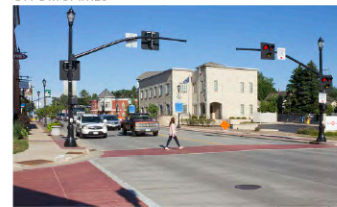
Well-marked crosswalks increase pedestrian safety