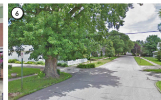
Neighborhood street with wide boulevard, narrow road