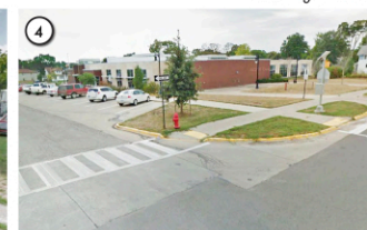
Bumpout and crosswalk at the public library