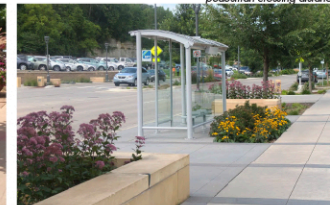
Paving patterns help guide pedestrians and seating options provide a place for respite on longer walks