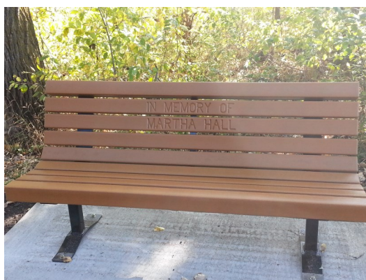
The selected bench is pictured above.

Bench placement will be done by parks staff as time and weather allow. Every effort will be made to complete installation within four weeks of receiving the bench, except in winter months.